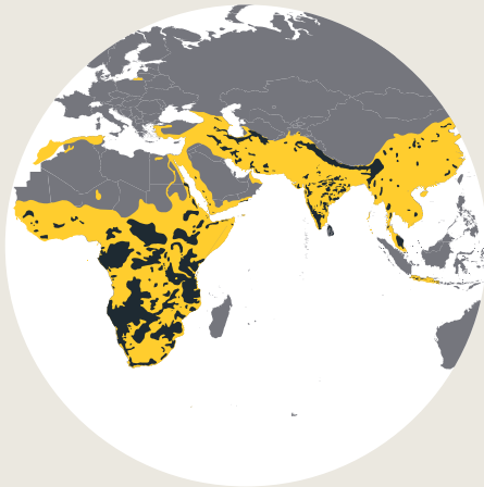
● CURRENT Leopard Range ● HISTORIC Leopard Range