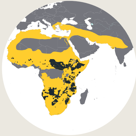
● CURRENT Lion Range ● HISTORIC Lion Range

DESPITE BEING SYNONYMOUS WITH WILD AFRICA, LIONS HAVE UNDERGONE A CATASTROPHIC DECLINE AND ARE ON THE BRINK OF EXTINCTION IN ALL BUT THE LARGEST AND BEST MANAGED PROTECTED AREAS.