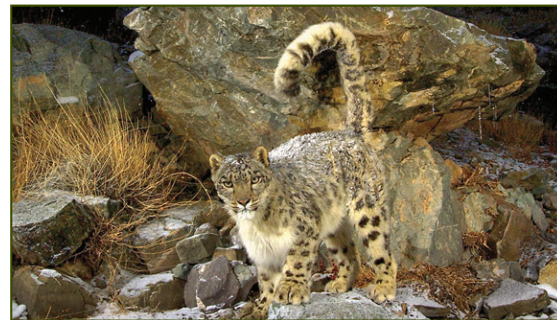
Camera trap images of wild snow leopards, Ladakh, India.