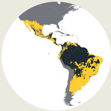
● CURRENT Jaguar Range ● HISTORIC Jaguar Range